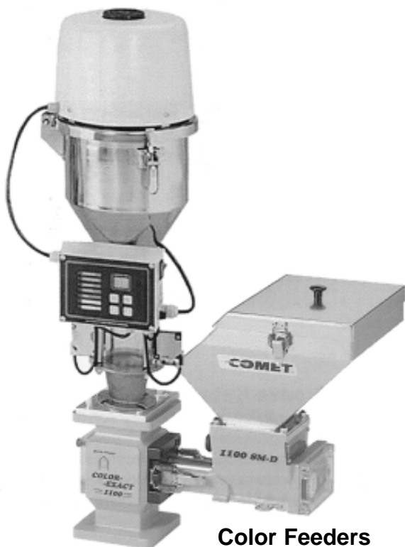
Color Feeders 2 Sizes