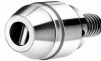
High Performance Ball Check Screw Tips