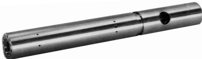
Barrels Nitrided, D2, CPM, Bimetallic