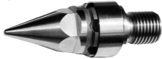
4-piece Repairable Abrasion Resistant