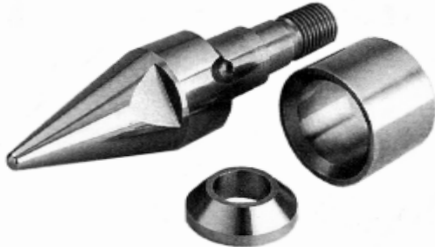
Conventional OEM Design