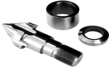
Free Flow H13 & CPM9V