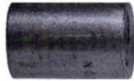
Galvanized Merchant Coupling