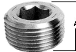
Brass Pressure Plugs (Flush Mount)