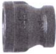
Galvanized Reducing Coupling