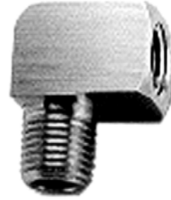
90 Degree Bar Stock Elbow