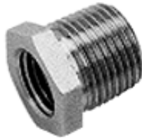
Brass Reducer Bushings Male / Female