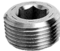
Galvanized Pressure Plugs (Flush Mount)