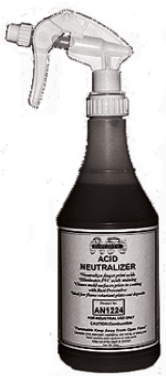
• 24 oz. bottle

Use our blanket order plan and save! Inquire for additional savings on larger quantities on all Aerosol & Bulk products!