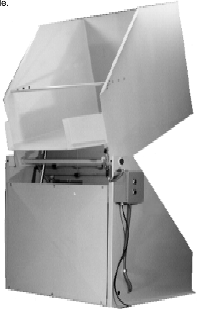
Model 30-25 Shown