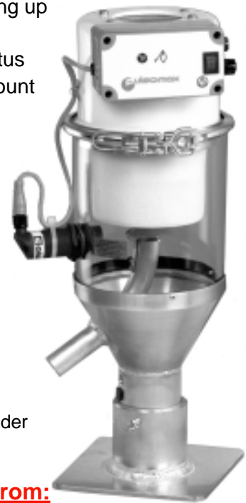
Model C1E Electric Loader